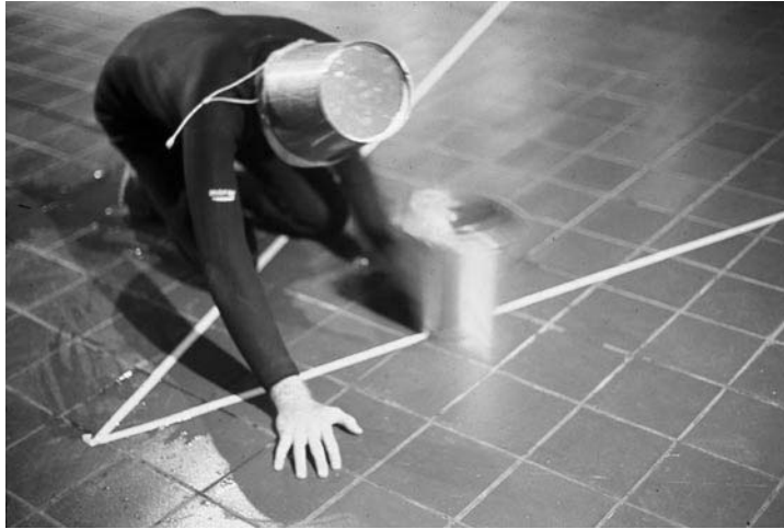
Bruce Barber, Bucket Action , 1973.

Since leaving New Zealand, your work would, on the surface, seem to have shifted from a process-based practice to a practice which is both more relational and more politicised. Rather than relational, you yourself use the term ‘littoral’ to describe your work, to locate an in-between space which operates outside conventional contexts of both public and commercial gallery systems. Can you talk a little about this shift in your work?