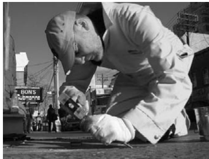
Diddly Squat , Toronto (2002): documentation of 30 hours of community service, scraping gum.

Published by Rm103 and Clouds on the occasion of the Bruce Barber exhibition 'party without party' at Rm103, Auckland, 8–17 June 2006.